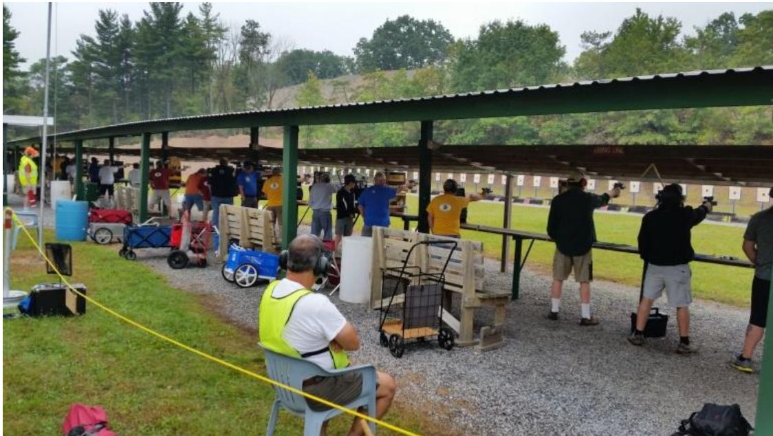
Walter Wise Memorial Police Pistol Match

This year was the 65th anniversary of the Walt Wise match with 73 shooters attending. Next year, we hope to be back on the rise.