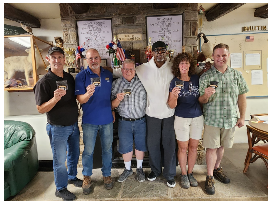
Recent RSO class graduates

Including HHA's on-site honey variety, there are more than 300 unique types of honey available in the United States alone, each originating from a different floral source. Varietal honey may be best compared to wine in terms of climatic changes. Even the same flower blooming in the same location may produce slightly different nectar from year to year, depending on temperature and rainfall. (National Honey Board).